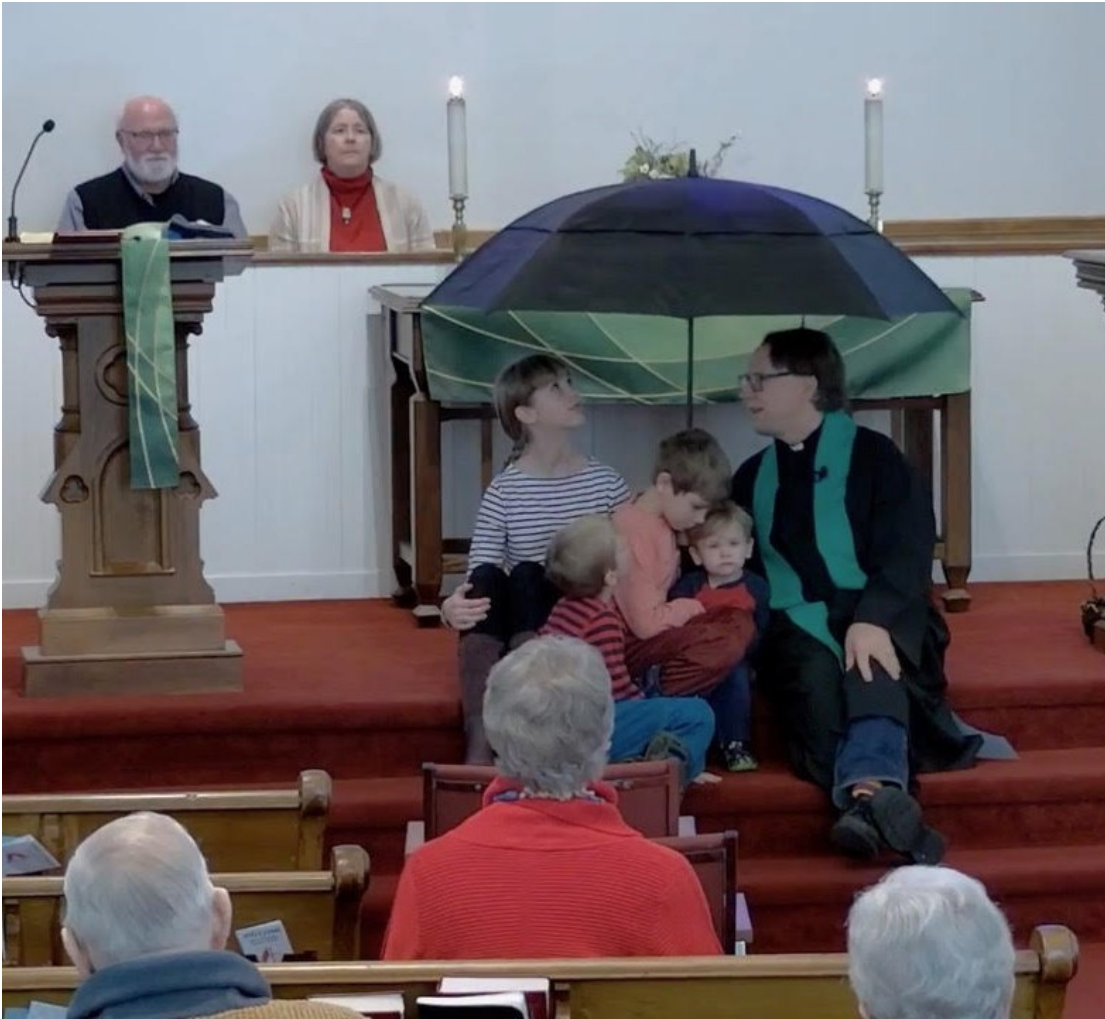
Children's Time - We can all share our umbrellas with others

Lent with a Community Ash Wednesday Service here, February 22, at 6:30. The service will include Centenary United Methodist, First Baptist of Pentwater, St. James Episcopal, and St. Paul United Methodist. Maundy Thursday services will be held April 6 at St. James, commemorating