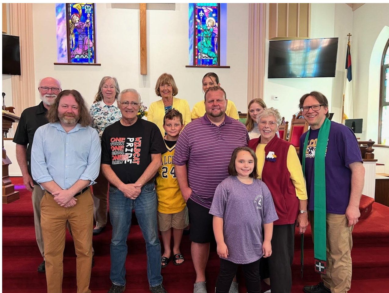
Teachers (active and retired), Administrators, and Students